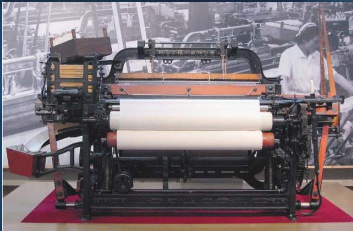
Toyoda Automated Loom